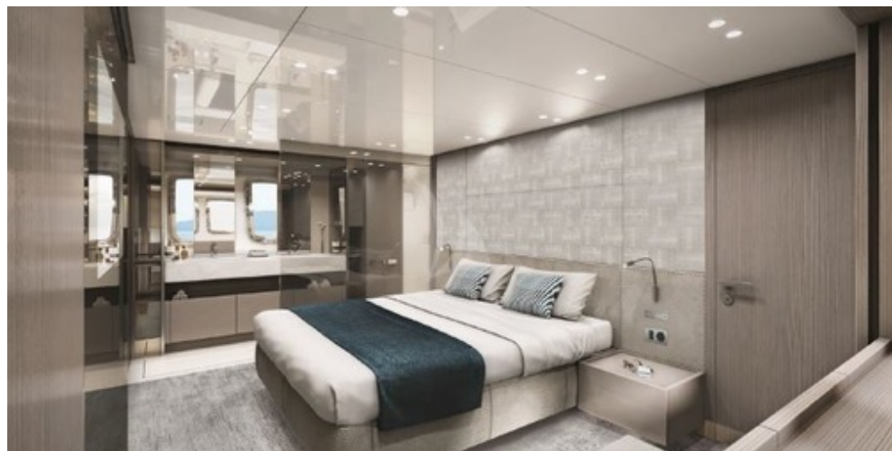
VIP cabin with tv VIP cabin