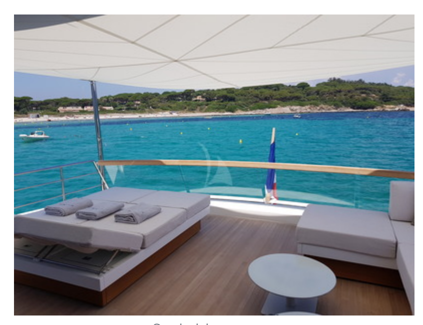
Sundeck lounge area