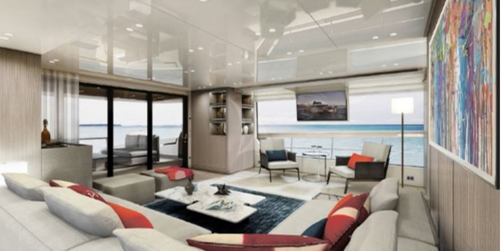
Main deck saloon view 1 Main deck saloon view 2