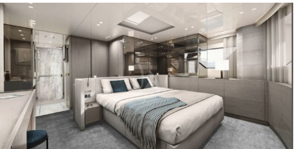
Master cabin with TV Master cabin